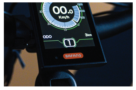
ODO: Odometer will display the total kilometers the bike has travelled. This cannot be reset.