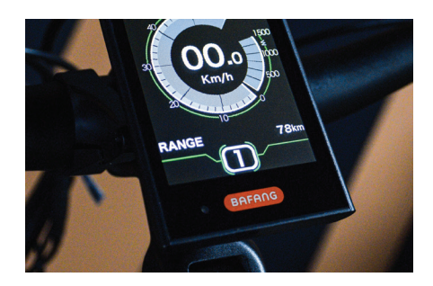
RANGE: Estimates total range remaining.