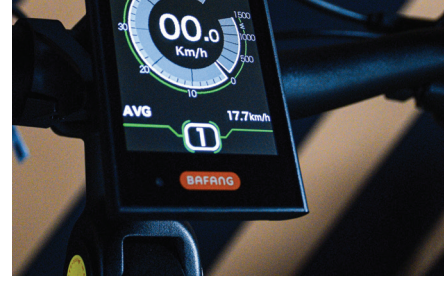
AVG: Average speed.