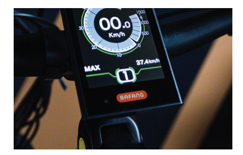
MAX: Will show your current max speed.