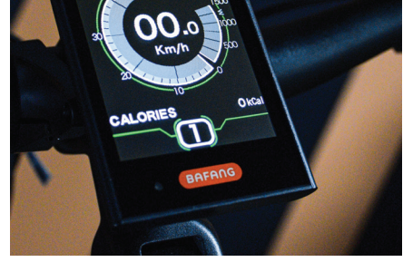
CALORIES: Estimates calories burned.