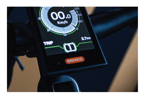
TRIP: By default when you turn the bike on it will display your trip in the bottom left. This will track the distance you have travelled in kilometers and can be reset whenever you desire. See settings mode for these instructions.

Your bike can track and display a variety of information from the main screen that can be changed using the "i" button.