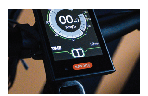
TIME: Tracks your total ride time.